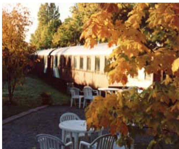
This train has been used as a Bed & Breakfast since 1989. It's beautiful in the autumn!

Name Tåget / the Train Location Vävaregatan 22, 222 37 Lund Homepage http://www.trainhostel.com/ Type Bed & Breakfast Arrival time Thursday 16-20, later if request Friday 10-12